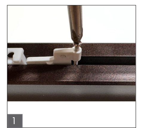
Remove the screw on the Master marked with a green dot.

Carefully unfold and flip rods without twisting the green motor belt, making sure the belt is still tucked inside the channel of the track. Twisting the belt during installation will cause the treatment to fail and must be avoided at all costs.